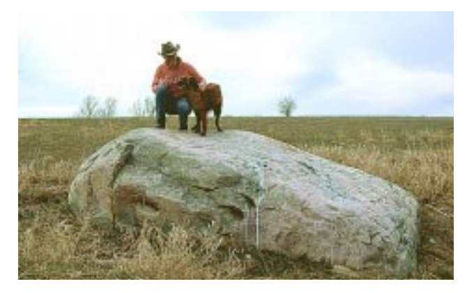
Large quartzite boulder, Marshall County.

Among the glacial erratics in northeastern Kansas, quartzite is one of the most common. Quartzite, a metamorphic rock, is quartz sandstone that is so thoroughly cemented with silica (SiO_2) that the rock breaks through the grains as easily as around them. It is harder than sandstone and can not be scratched by a knife. The quartzite boulders in the Glaciated Region are known as Sioux quartzite because they come from the area where Sioux quartzite crops out in the area around Sioux Falls, South Dakota.