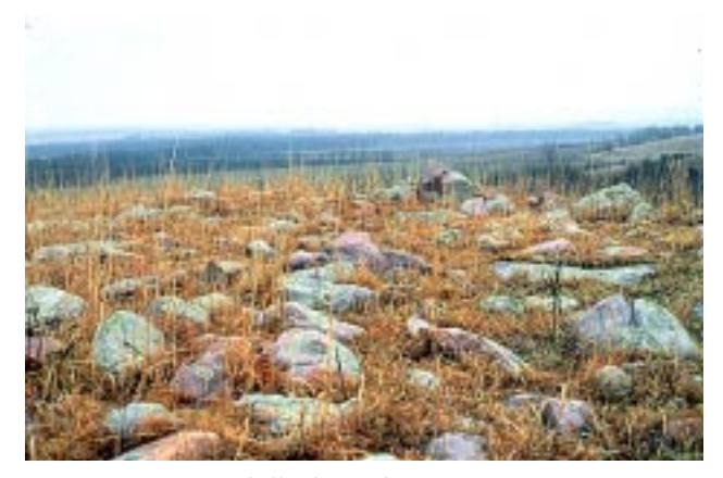
Sioux quartzite on hillside, Wabaunsee County.

Quartzite boulders in Wabaunsee County. —Although boulders of Sioux quartzite are found throughout the Glaciated Region, a hillside in northern Wabaunsee County has more than most places. These quartzite boulders are metamorphic rocks—sandstone that has been metamorphosed into quartzite.