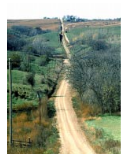
Loess hills, Doniphan County.

in places, occur along the bluffs of the Missouri River. The loess in this region is typically a yellowish-buff, porous silt that crops out with steep faces along hillsides and valley walls. Small, white shells of snails also may be found in the loess. In northeastern Kansas a very rich soil has developed on the loess, especially in Brown and Doniphan counties and along the bluffs