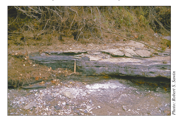
Figure 4—Outcrop of a thin coalbed in Cherokee County, Kansas.

Coal beds in southeastern Kansas generally produce between depths of 600 to 1,200 ft, although elsewhere in the United States production from coals appears to be good down to a depth of about 3,000 ft. Cleats start to compress shut at depths deeper than this, and thus gas may have trouble making it to the well bore. Deeper coalbed methane production in