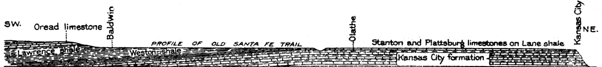
SECTION FROM KANSAS CITY THROUGH OLATHE AND BALDWIN ALONG LINE OF OLD SANTA FE TRAIL. [U.S.G.S. BL. 612]