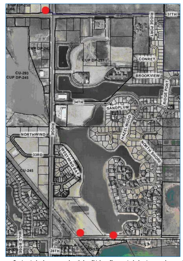
Figure 2. Aerial photograph of the Ridge Port pit lake in northwest Wichita. The red dots indicate the locations of the three monitoring wells.

The KGS was responsible for interpreting, reporting, and presenting the study results. The two KGS reports, along with a PowerPoint presentation and the chemical data, can be viewed or downloaded from the web page http://www.kgs.ku.edu/Hydro/Sand/index.html. This Public Information Circular summarizes the findings of the study. Terms shown in bold are defined in the glossary at the end.