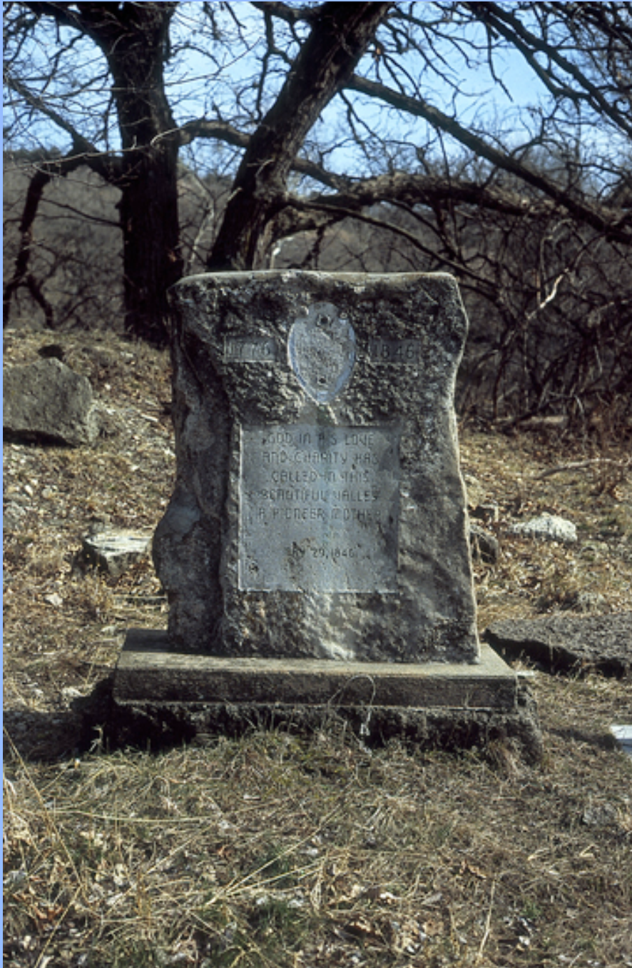
Donner Party gravestone (1846)