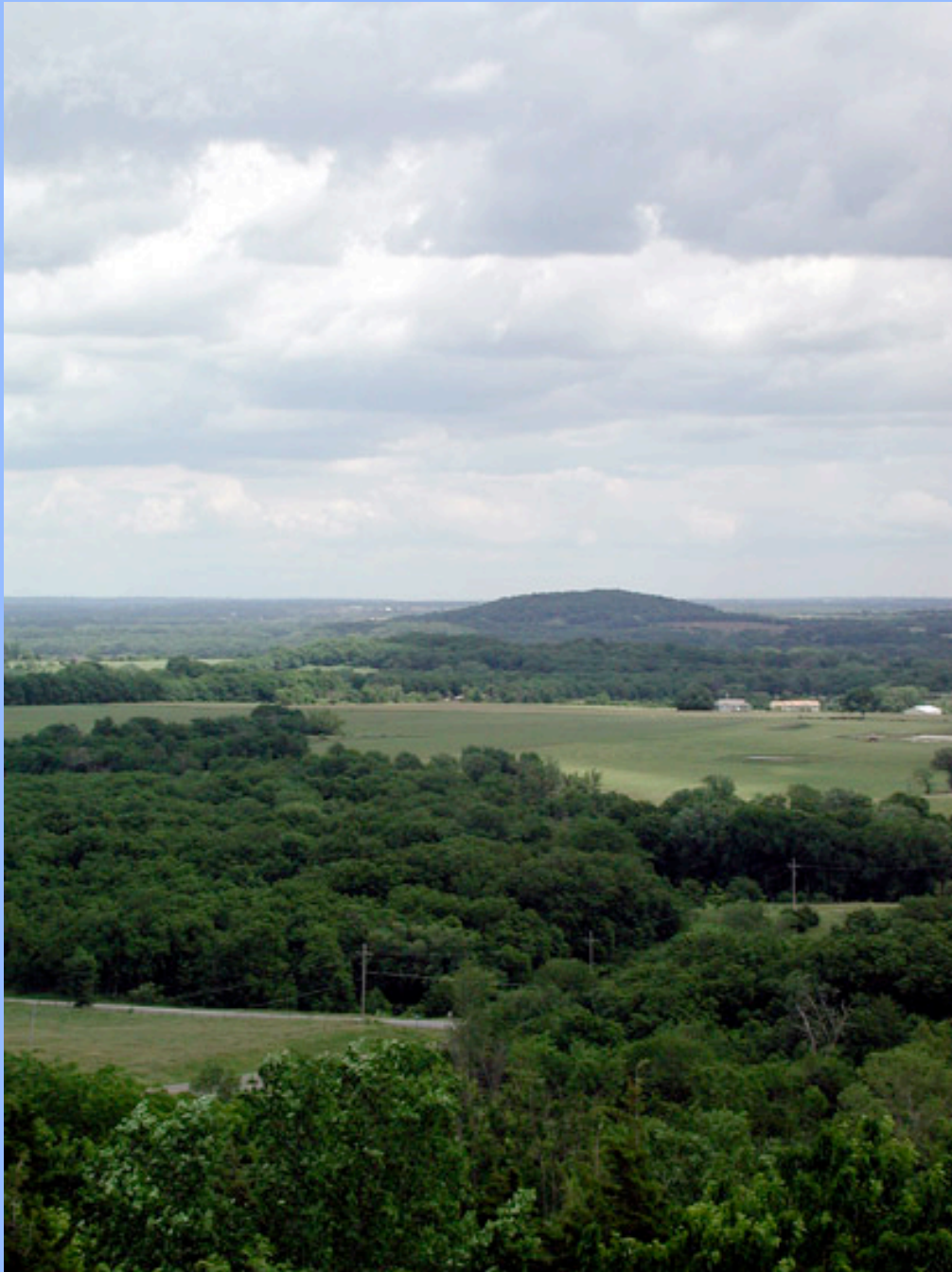
Blue Mound, from Wells Overlook