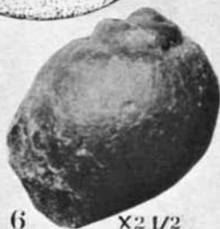
6 x2 1/2