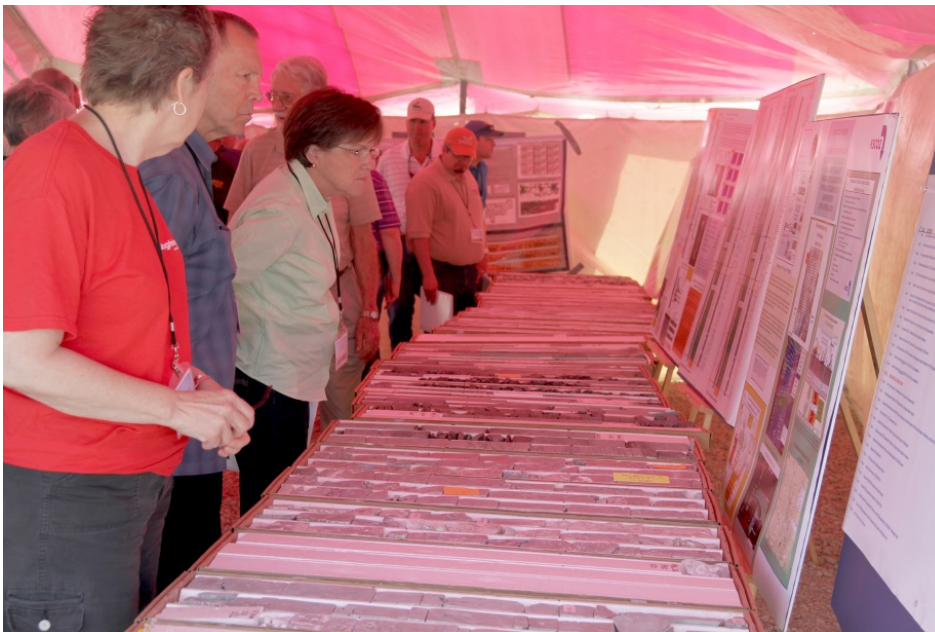
Portion of the Mississippian oil reservoir and caprock and the lower Arbuckle injection zone were displayed along with posters relating to the project and the core.