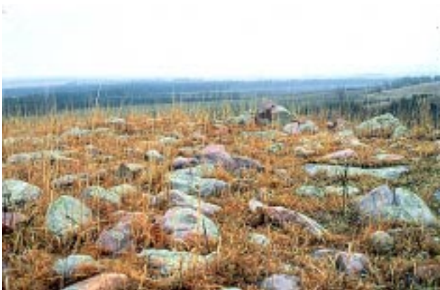
Sioux quartzite on hillside, Wabaunsee County.

Quartzite boulders in Wabaunsee County. —Although boulders of Sioux quartzite are found throughout the Glaciated Region, a hillside in northern Wabaunsee County has more than most places. These quartzite boulders are metamorphic rocks—sandstone that has been metamorphosed into quartzite.