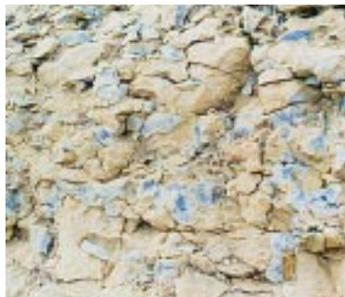
Chert in limestone, Riley County.

Chert. —Commonly known as flint, chert is found in many Kansas limestones as nodules or continuous beds. It is a sedimentary rock composed of microscopic crystals of quartz (silica, \text{SiO}_2 ). It is opaque and ranges in color from white to dull gray or brown to black. Chert breaks with a shell-like (conchoidal) fracture, and the edges of the broken