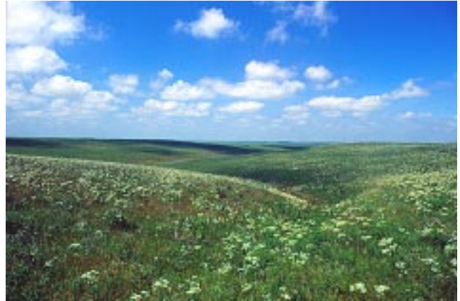
Springtime in the Flint Hills, Greenwood County.

pieces are sharp. Because of this, people have used chert for thousands of years to make tools and weapons. In the Flint Hills, a bluish-gray chert is commonly seen in roadcut exposures of the Florence Limestone Member (part of the formation called the Barneston Limestone).