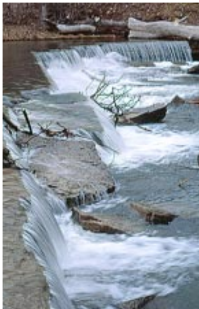
Pillsbury Crossing, Riley County.

Pillsbury Crossing. —South of the town of Zeandale in Riley County, Deep Creek flows over a ledge in the